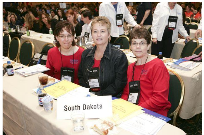
The SDHIMA Delegation at the House of Delegates